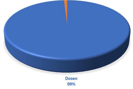
Figure 1. Composition of participants

The training is carried out by presenting material and discussions. The activity was filled with topics on the strategies for turning research results into monograph books and how to publish them in publishers. Activities were carried out to answer participants' problems in looking for options for publishing the research in the others form of research articles. It means in the form of a monograph book with ISBN which suitable format with the regulations of the National Library, so it has wide usefulness. Some of the equipment used in carrying out community service is laptops, internet, and video conference zoom meetings.