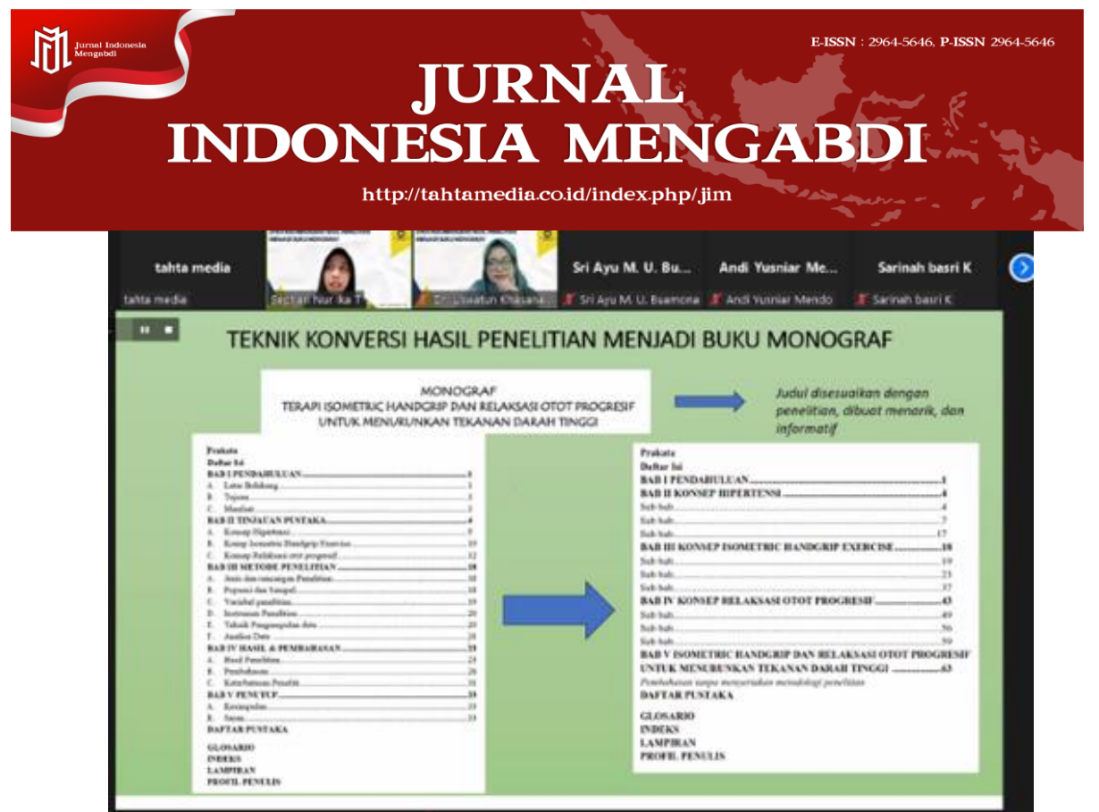
Figure 2. Material Explanation and discussion