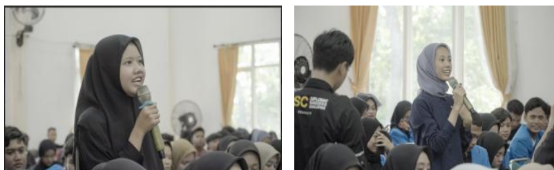
Figure 3: Discussion Activities between Participants and Speakers

The next stage was a discussion conducted by the speaker and the participants. This stage applied the question-and-answer method in order to provide space for participants to confirm the information obtained from the speaker.