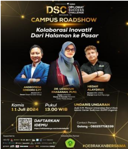
Figure 1. Flyer of Service Activities

By observing the enthusiasm of students with various themes offered, the service team deliberated on following up on this service with the theme of Assistance and Training in Preparation of Business Plans in collaboration with Diplomat Success Challenge. After determining the material to be delivered, a schedule of activities was determined, which was held at the A.H. Mansur Undaris Hall, Semarang Regency, on July 11, 2024, with a target of 500 students as participants. In recruiting participants, flyers were distributed openly through social media and filling out Google Forms for free registration.