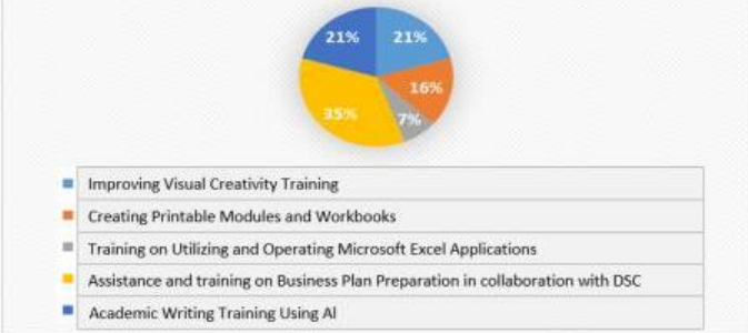
Diagram 1. Themes of Materials offered

By observing the enthusiasm of students with various themes offered, the service team deliberated on following up on this service with the theme of Assistance and Training in Preparation of Business Plans in collaboration with Diplomat Success Challenge. After determining the material to be delivered, a schedule of activities was determined, which was held at the A.H. Mansur Undaris Hall, Semarang Regency, on July 11, 2024, with a target of 500 students as participants. In recruiting participants, flyers were distributed openly through social media and filling out Google Forms for free registration.