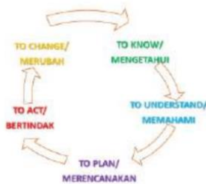
Figure 1: Participatory Action Research Process

The PAR model begins with a study of the problems faced by the community, determining solutions, planning actions, and implementing plans to achieve the set goals (I. S. Wekke, 2022). The service steps with the PAR method (Participatory Action Research) is described as follows: